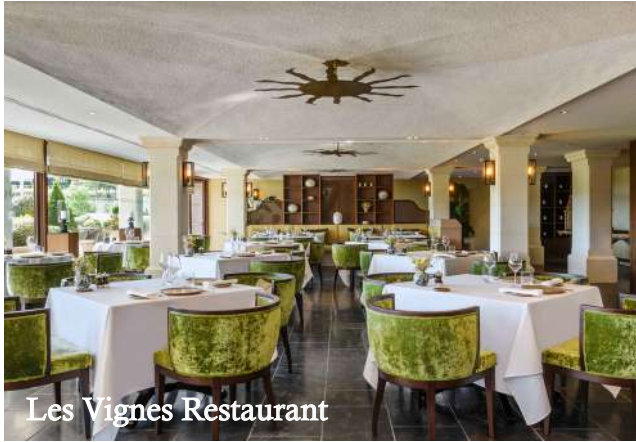
Les Vignes Restaurant