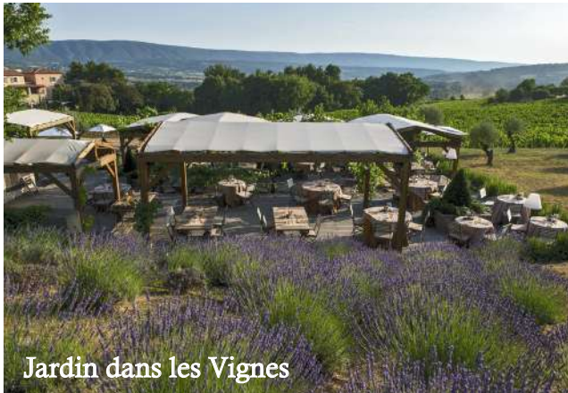
Jardin dans les Vignes