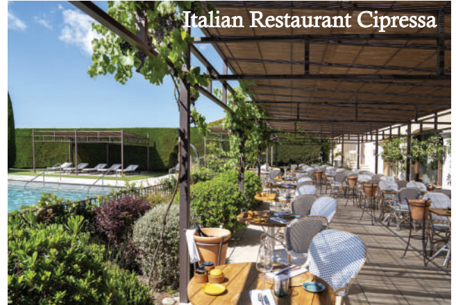
Italian Restaurant Cipressa